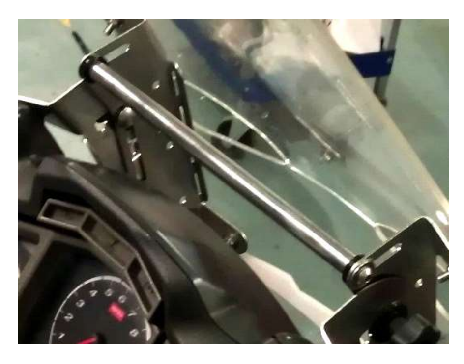
Mount the screen onto the brackets, taking care to fit a rubber washer (in each fastener location) between the screen and the metal brackets.

Do not over-tighten the screen fasteners (just enough to lightly compress the rubber washers) and this will cause stress/cracking in the screen.